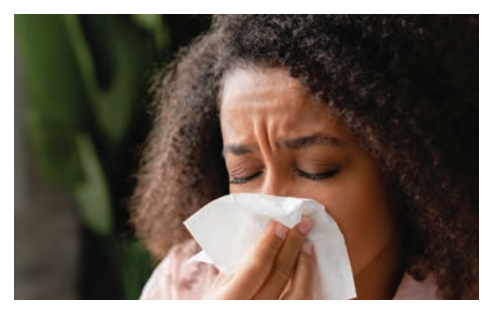
Cover coughs and sneezes with a tissue or your elbow.